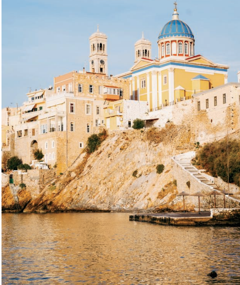
Agios Nikolaos Church, in Ermoúpolis.

a-sandy-shore vision most Americans have of the islands. The visitors who do come—the majority are from France and Scandinavia—are drawn by the festivals and thriving art scene, the more than 1,300 Neoclassical buildings, and the incredible cuisine.