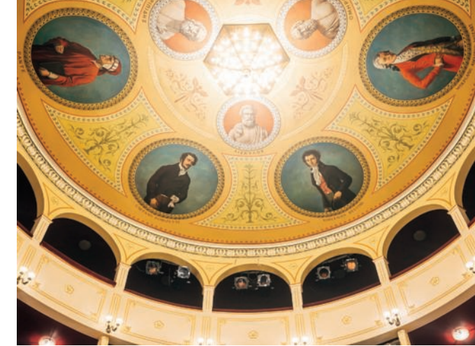
The ceiling of the Apollon Theater, in Ermoúpolis. Below: The waterside terrace at the Hotel Ploes.